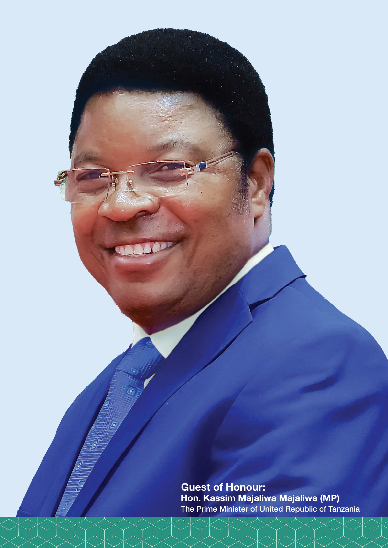
Guest of Honour: Hon. Kassim Majaliwa Majaliwa (MP) The Prime Minister of United Republic of Tanzania